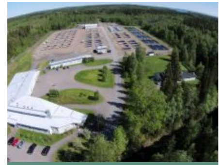
Kainuu Fisheries Research Station