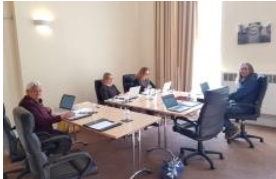
DMG meeting in Buxton, England, April 2023