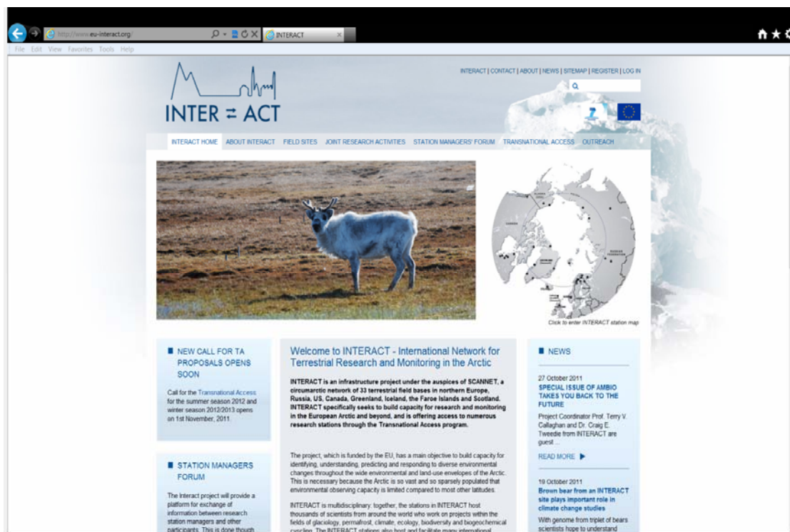
The main page of INTERACT's web site.

The Transnational Access pages were expanded during autumn 2011 to include an electronic application and evaluation system used for the TA calls.