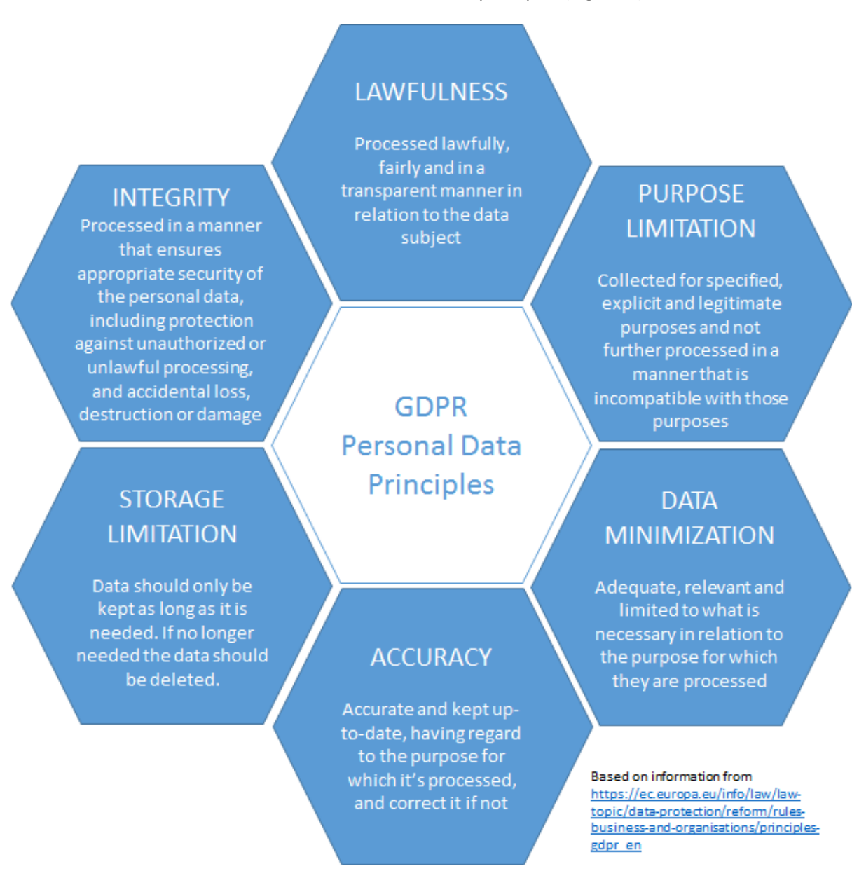
Figure 1. The six principles that provide good quidelines on how to handle personal data

Personal data shall be handled with consideration to six principles (Figure 1).