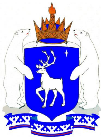
Yamal-Nenets Autonomous District