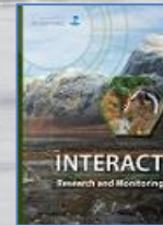
INTERACT Research and Monitoring Report