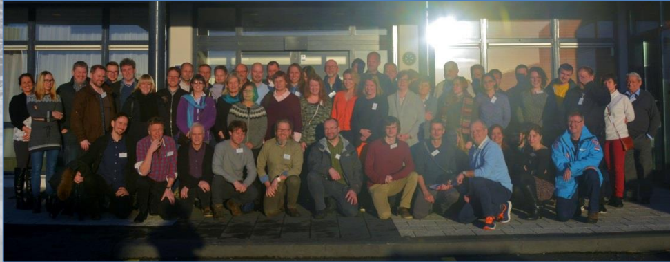
Managers of 83 research stations and other INTERACT participants