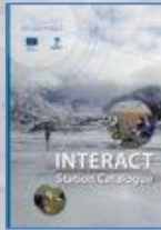
INTERACT Station Catalogue