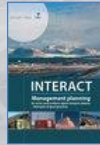
INTERACT Management Planning Handbook