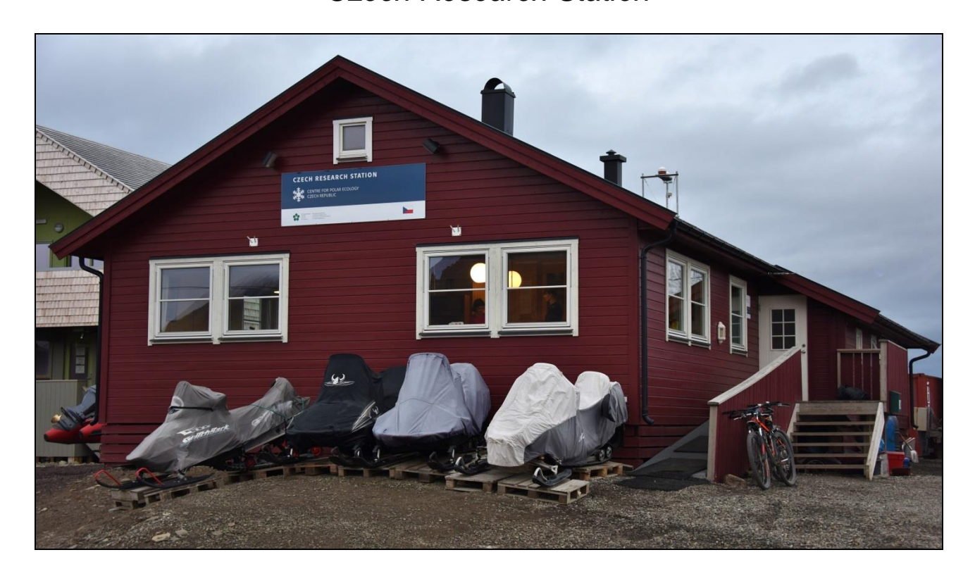
20-25 October 2017, Longyearbyen, Svalbard

Document ID: D3.2.doc © INTERACT consortium